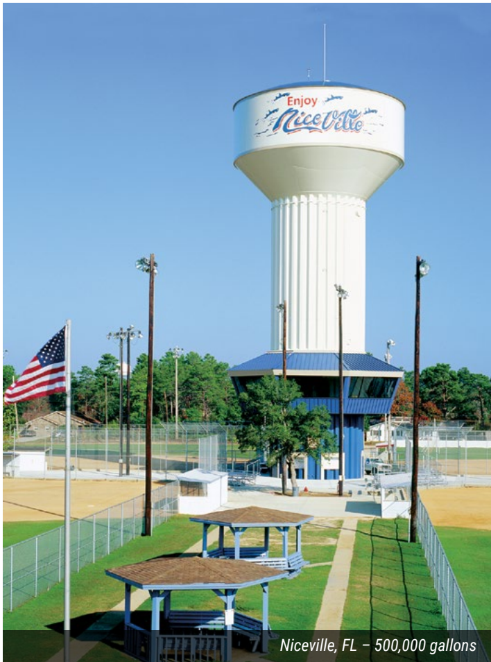
Niceville, FL – 500,000 gallons