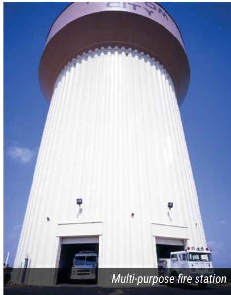
Multi-purpose fire station