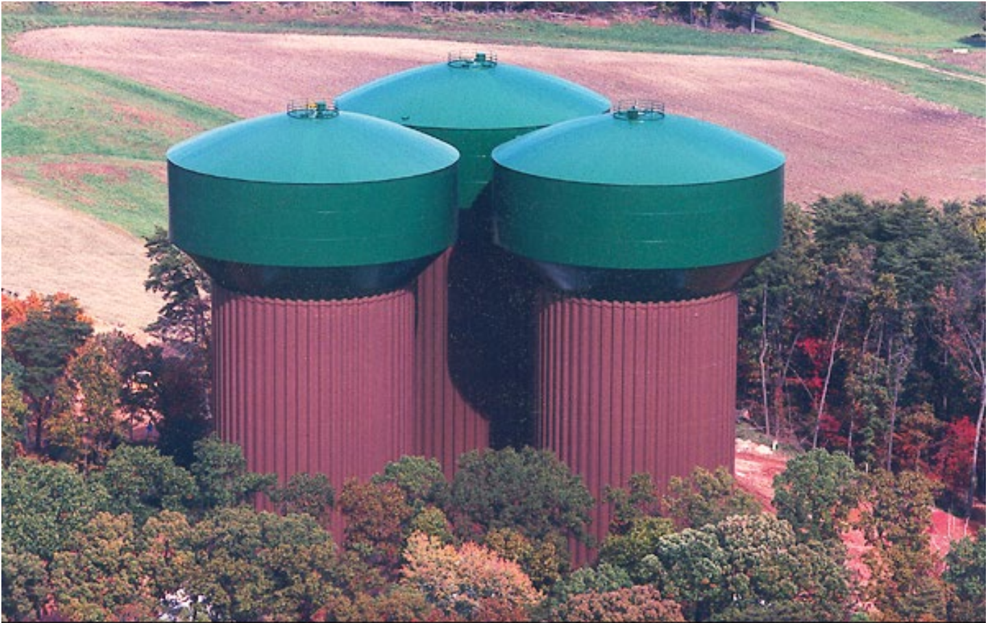
Bowie, MD – (3) 1,500,000 gallons each