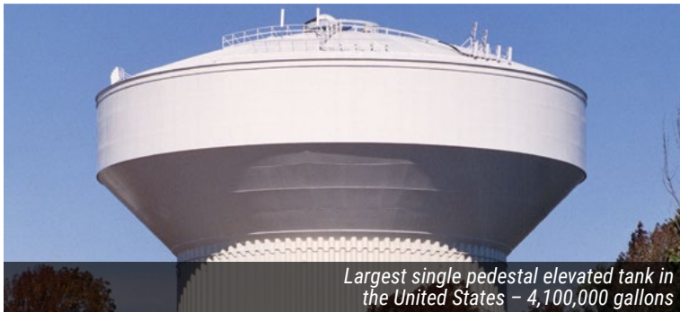
Largest single pedestal elevated tank in the United States – 4,100,000 gallons