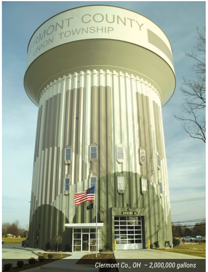
Clermont Co., OH – 2,000,000 gallons