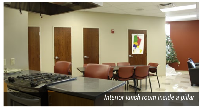
Interior lunch room inside a pillar