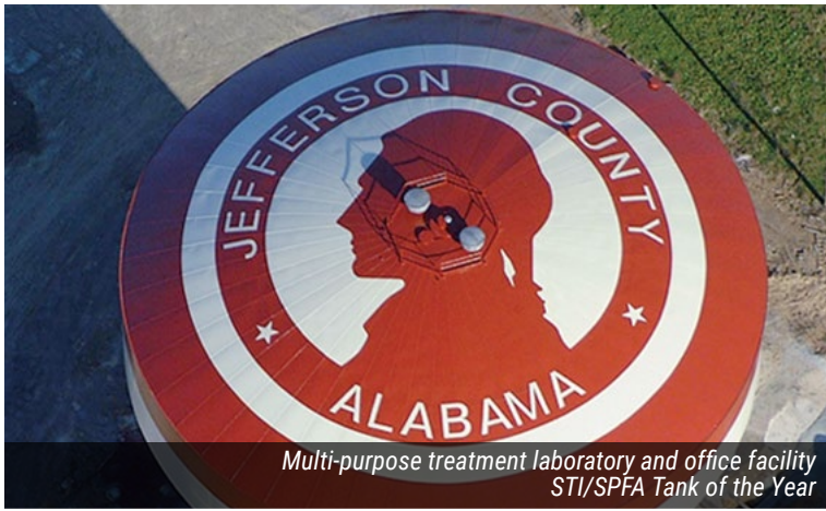
Multi-purpose treatment laboratory and office facility STI/SPFA Tank of the Year