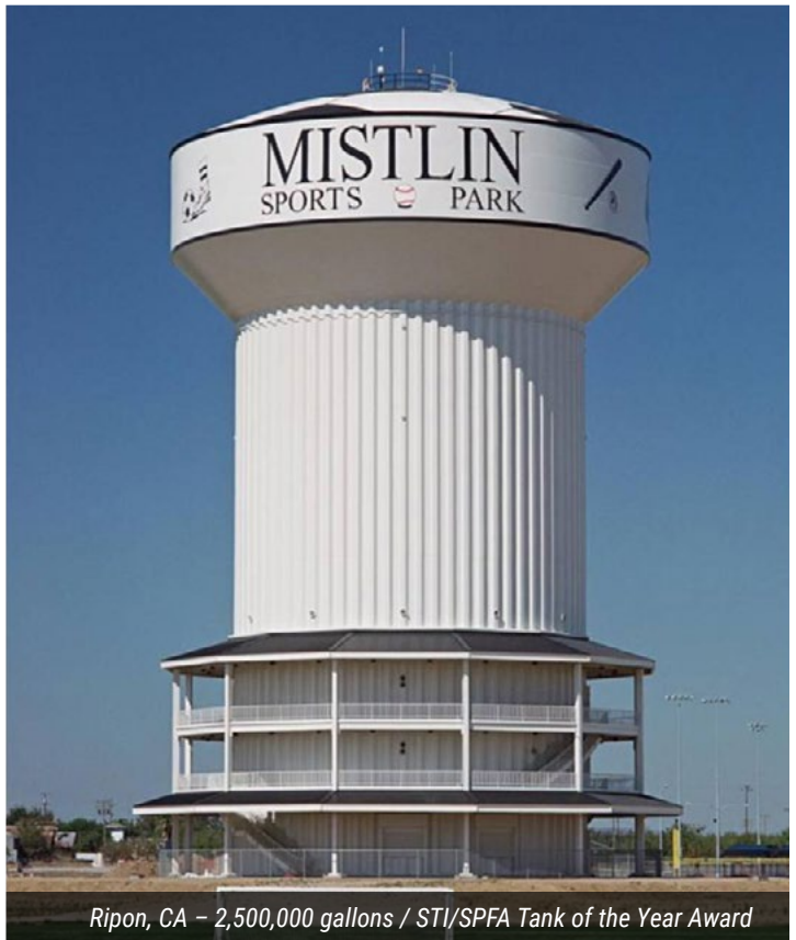
Ripon, CA – 2,500,000 gallons / STI/SPFA Tank of the Year Award