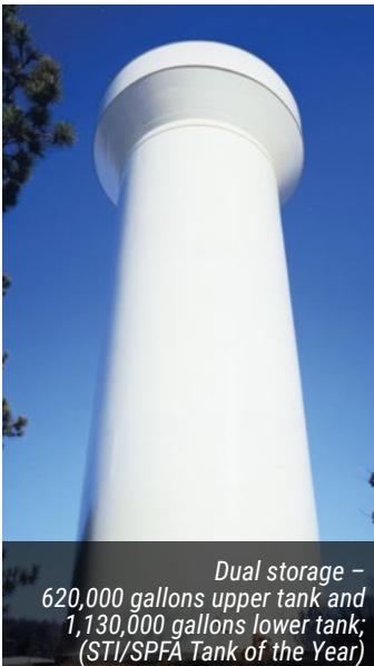
Dual storage – 620,000 gallons upper tank and 1,130,000 gallons lower tank; (STI/SPFA Tank of the Year)