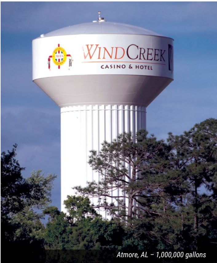
Atmore, AL – 1,000,000 gallons