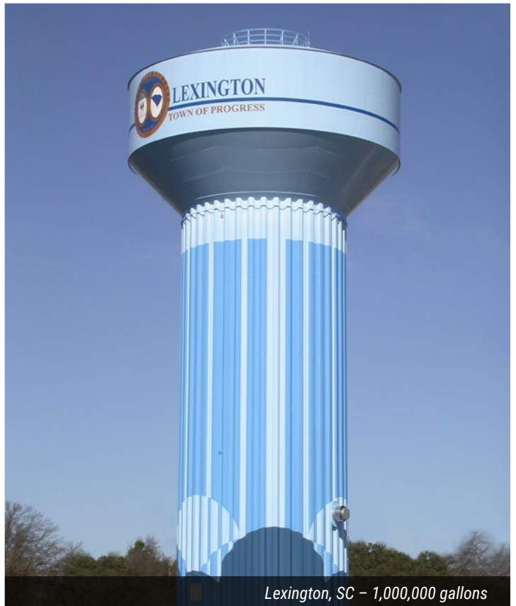
Lexington, SC – 1,000,000 gallons