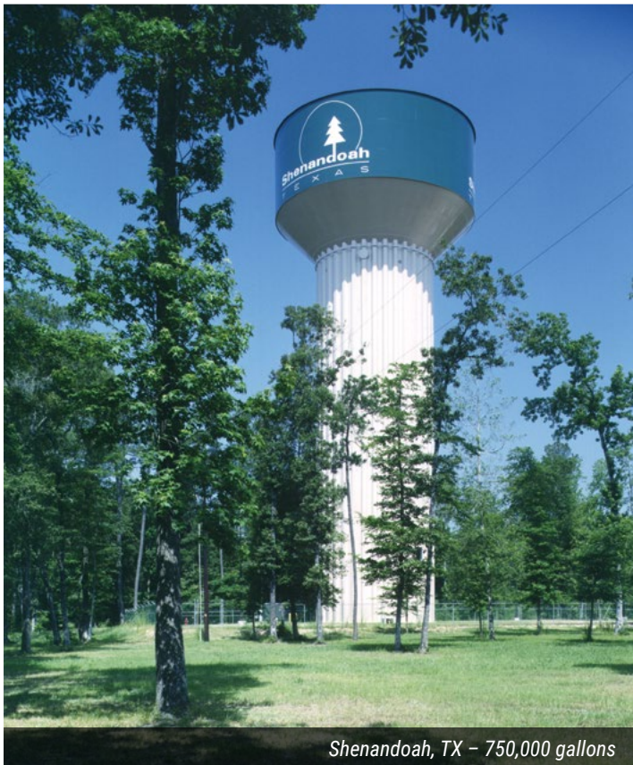
Shenandoah, TX – 750,000 gallons