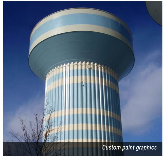
Custom paint graphics