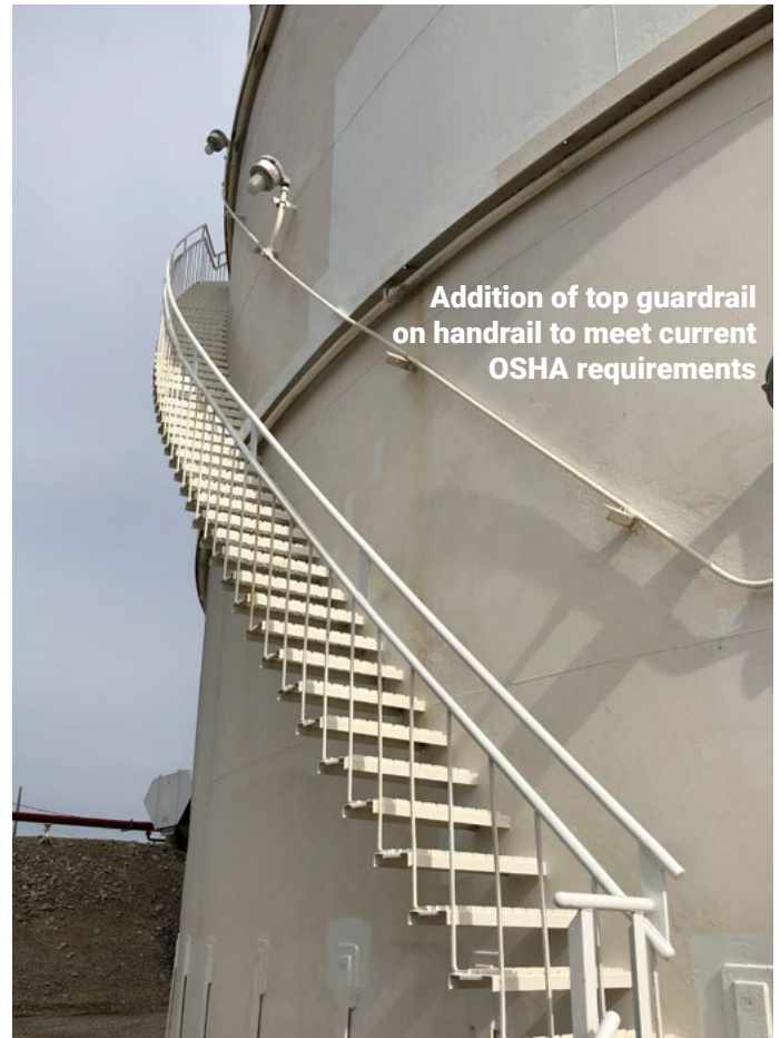
Addition of top guardrail on handrail to meet current OSHA requirements