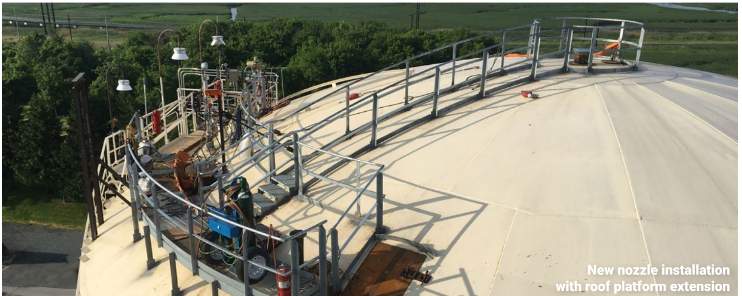
New nozzle installation with roof platform extension

In-service inspections are the first step to identifying lifecycle services for each unique storage facility. CB&I conducts in-service inspections of LNG tanks to identify potential areas for update, repair or maintenance. Next, we engage with plant management, operators and/or owners to discuss which LNG storage lifecycle services are best suited to meet current and future needs.